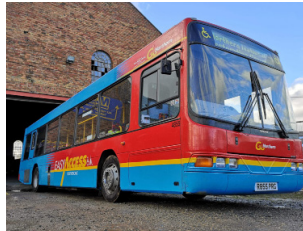
Volvo B10BLE/Wright Renown 4855 / R855 PRG