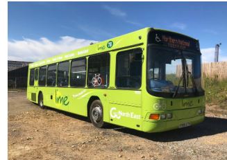
Volvo B10BLE/Wright Renown 4898 / V988 ETN