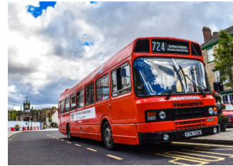
Leyland National Mk2 4710 / FTN710W