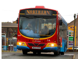
Scania L94UB/Wright Eclipse Solar 5217 / NK54 NVN