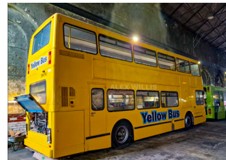
Volvo Olympian FVK 3814/S814