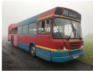
Leyland National Mk2 4681 / UPT681V

The NNRG currently own six vehicles which have been restored by the group members.